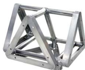
3-Way To Vertical