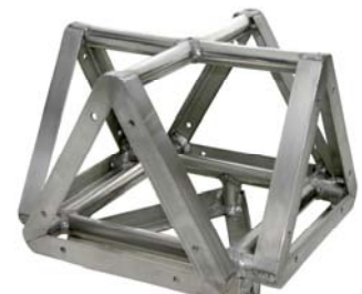
4-Way To Vertical