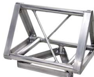
2-Way To Vertical