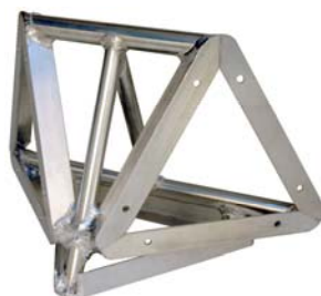
90 Degree To Vertical