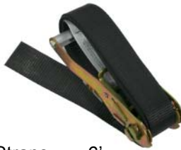
Ratchet Straps 6'