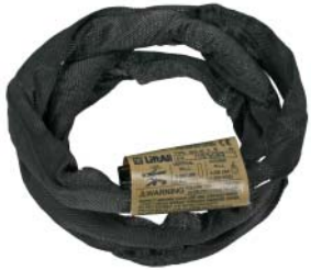
Steelflex Roundslings 3', 6'