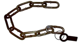
STAC/Deck Chain 3', 5'