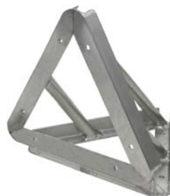
90 Degree Vertical