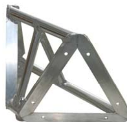
90 Degree Horizontal