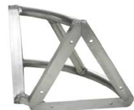
90 Degree Radial